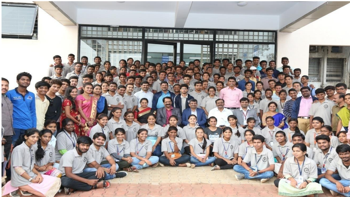
Group Photo of NIC Camp- 2018