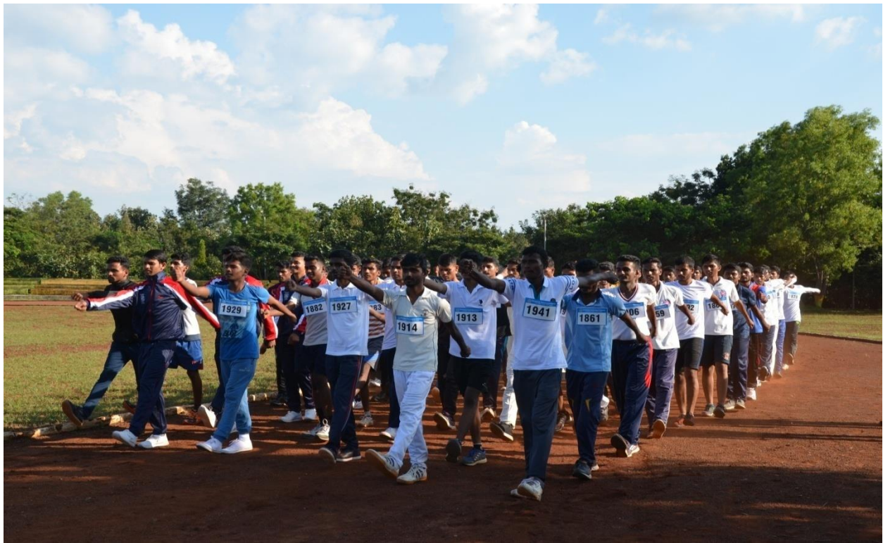
State Pre-Republic Day Parade Selection Camp for Boys - Physical Training on 03 and 4 Oct 2018