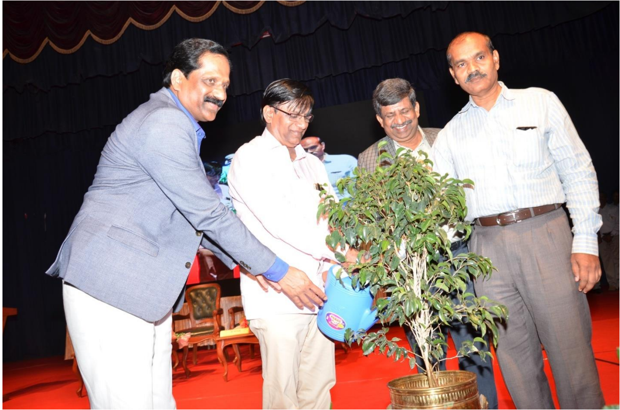
Inauguration of Slowdown Save Lives programme)