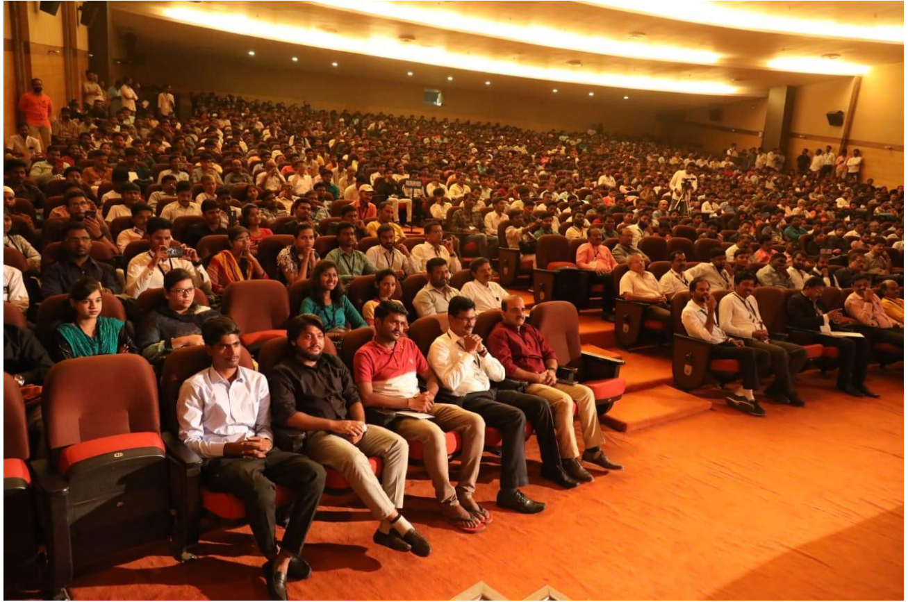
Two weeks workshop on Carrer Guidance for Civil Services Exams held at Govt. Engg College Hassan from 12 to 23 Feb 2020