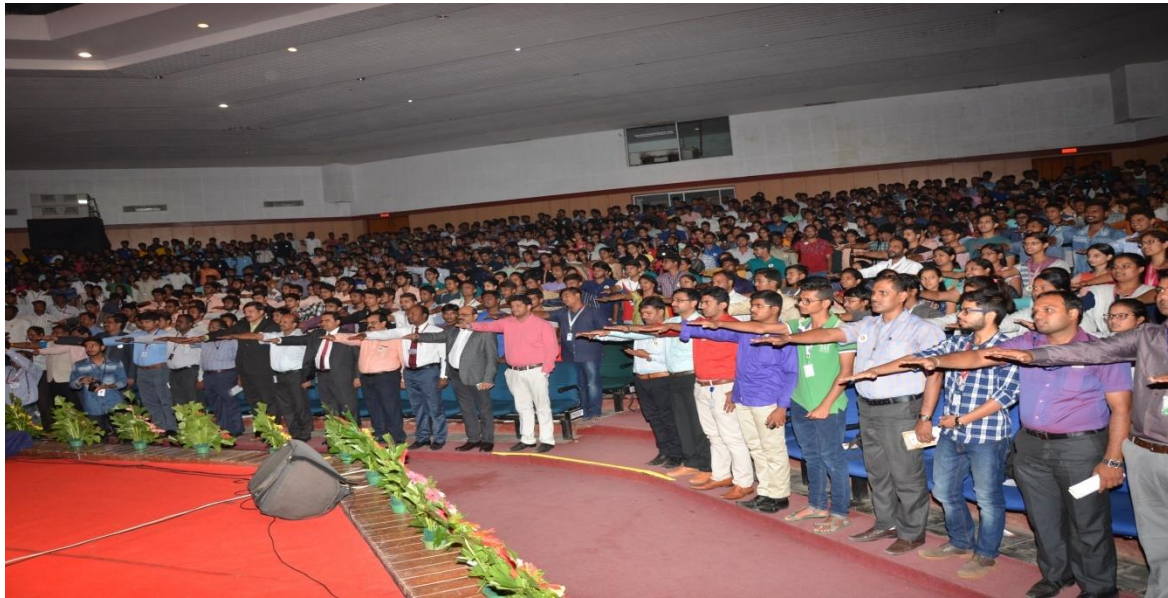
Group Photo of Slowdown save lives programme