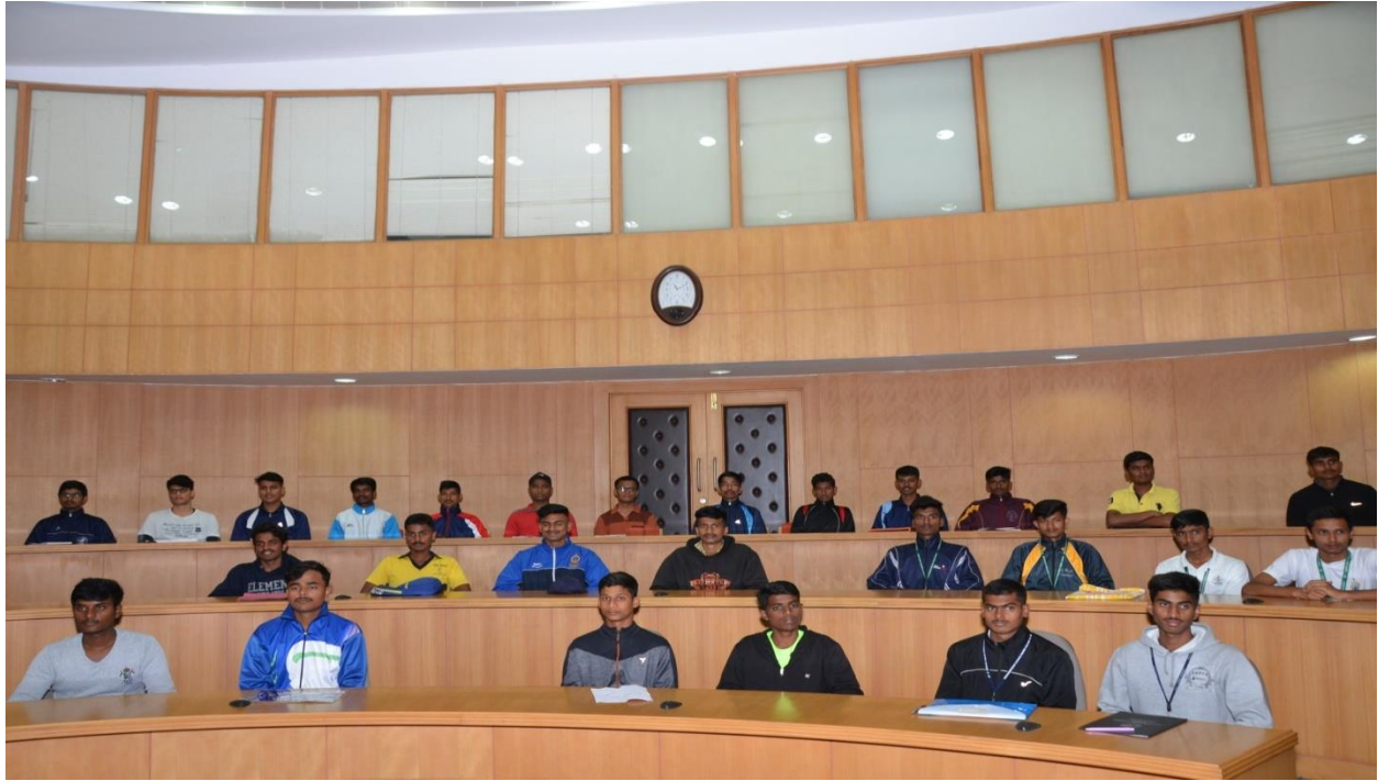
International Conference on NSS 50 th year 1969 ( Golden Jubilee) Foundation Day 2019)