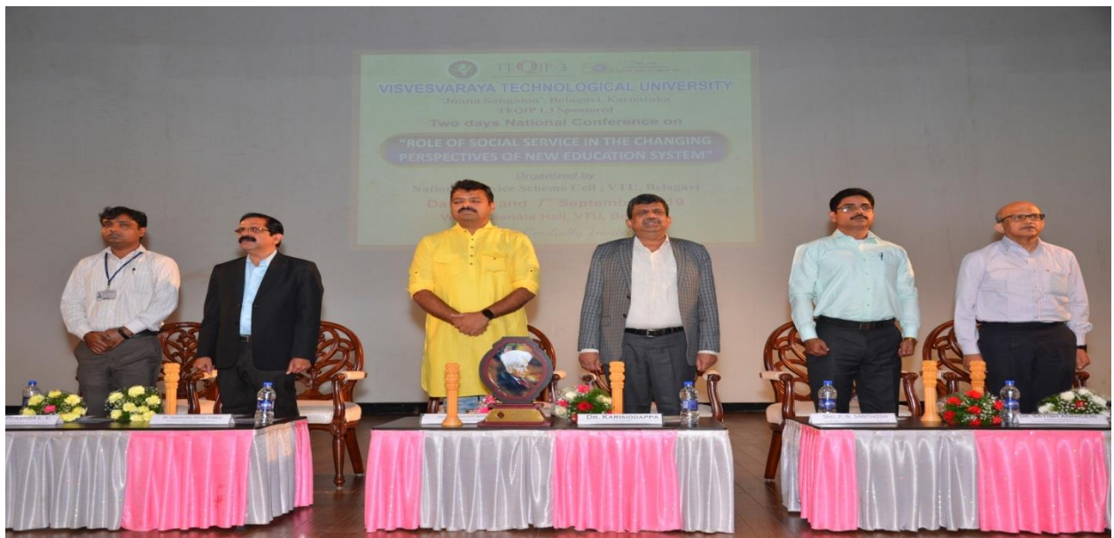
Inauguration of International Conference on NSS 50 th year 1969 Foundation Day 2019 (Golden Jubilee Year)