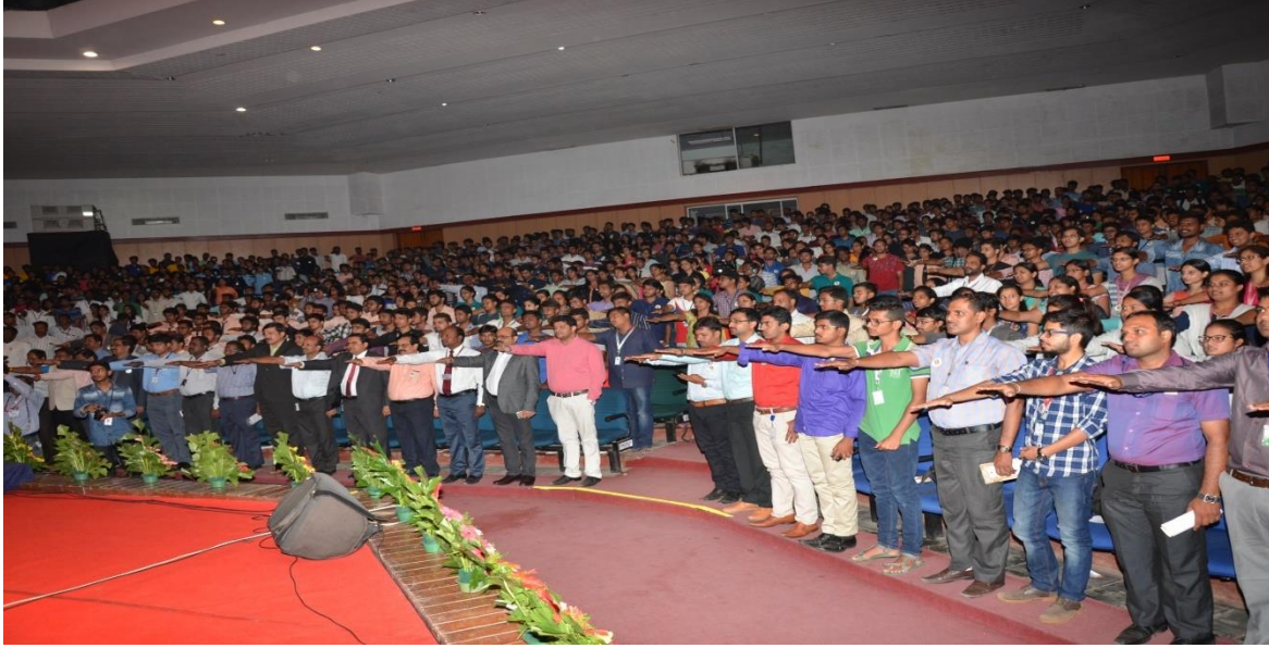
Group Photo of Slowdown save lives programme

Celebration of Dr. B.R. Ambedkar's 125 th Birth Anniversary and Propagation of Ambedkar's Principles