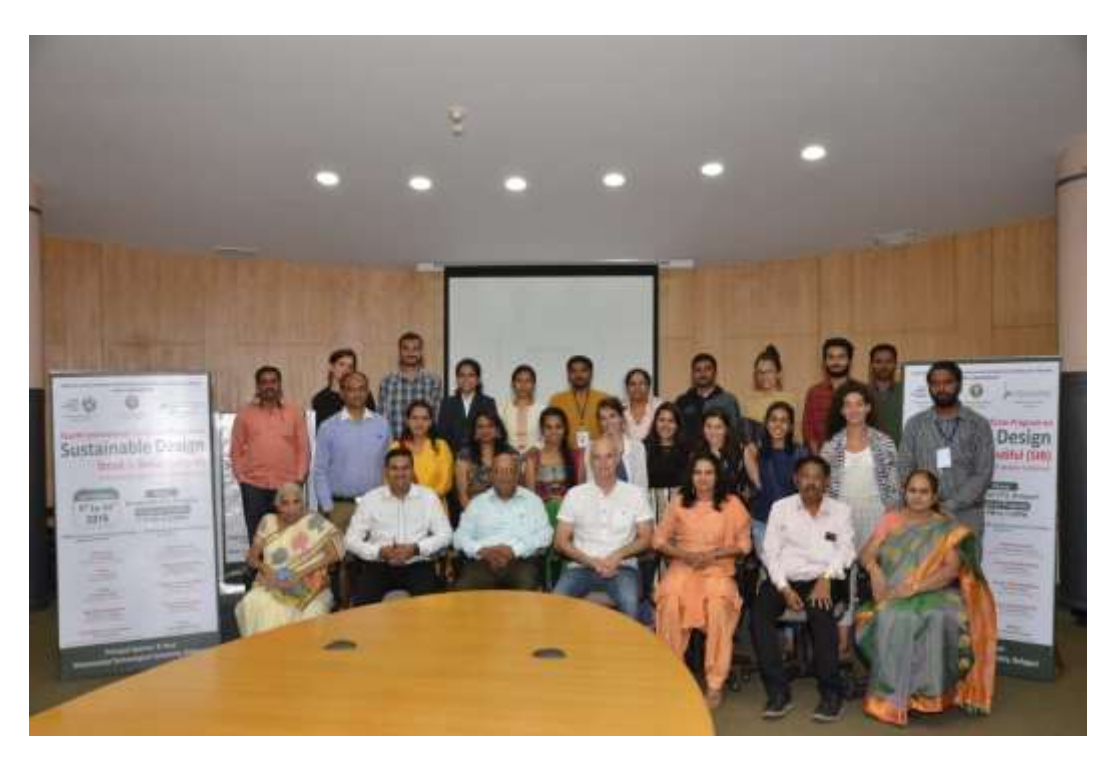
Participants along with residents of case studies at the Valedictory function of SIB 2019, Belagavi, India

Civil Engineering Department Centre for P.G. Studies, Jnana Sangama, Belagavi – 590018