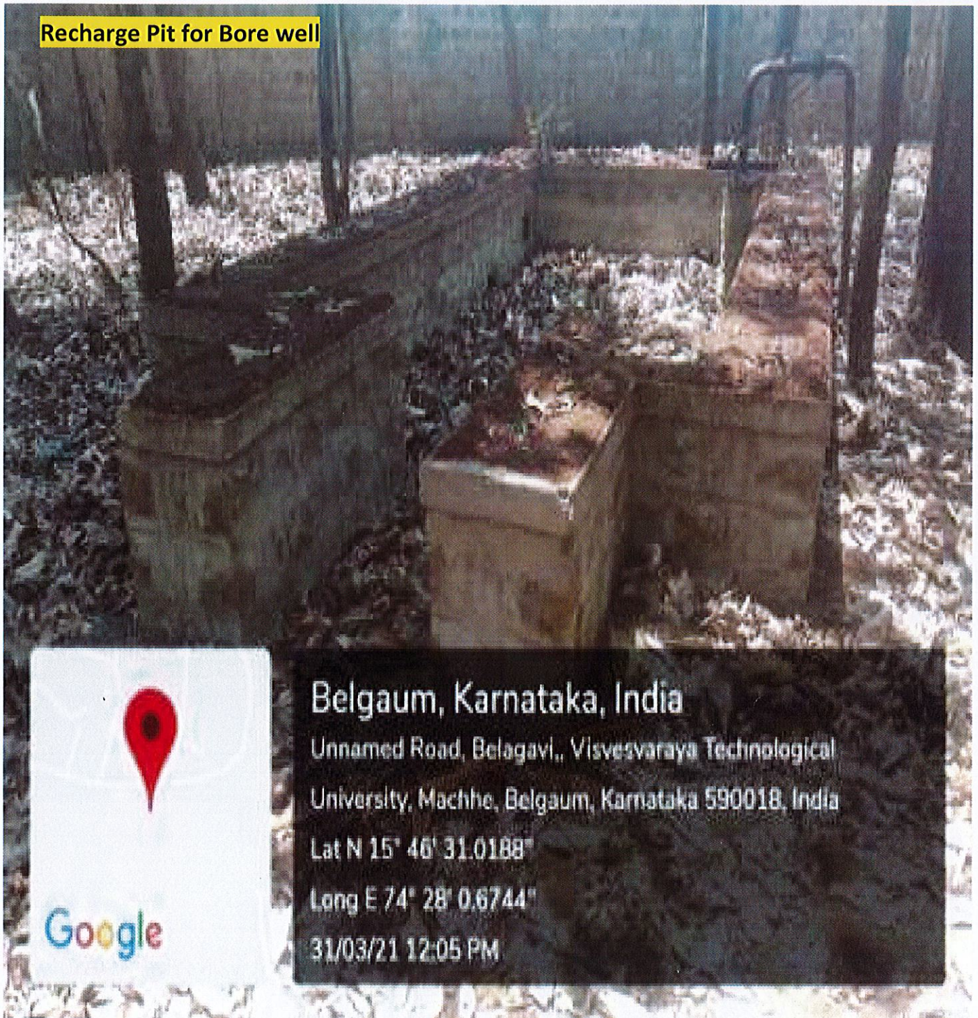
Recharge Pit for Bore well