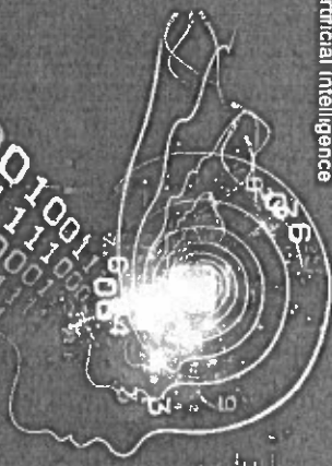
Photo indicating the theme of the conference Artificial Intelligence

Registration and Welcome Tea : 08:00 Hrs Technical Session – I : 09:30 Hrs Session Tea : 11:00 Hrs Technical Session – II : 11:30 Hrs Lunch : 13:00 Hrs PAPER PRESENTATIONS Session Tea : 15:30 Hrs Valedictory : 16:00 Hrs