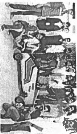
Participants of National internship program enjoying the happy moments of fabricating the race car.

Cambridge group of institutions takes pride to announce the International Conference on Science, Engineering and Management (ICSEM 2020) at CIT-NC in association with Institute For Engineering Research and Publication (IFERP)