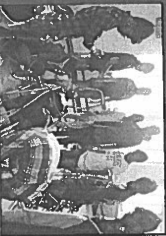
During this internship, staff & students have designed and developed race car.

Various AICTE Sponsored Conferences, FDPs, seminars and workshops are organized very frequently. Recently 8-days National Internship was conducted during Sep'2019. Participants of National internship program applying the theoretical knowledge gained during theory sessions to fabricate race car.