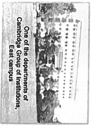
One of the departments of Cambridge Group of Institutions, East campus