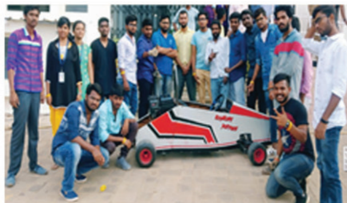
Participants of National internship program enjoying the happy moments of fabricating the race car.