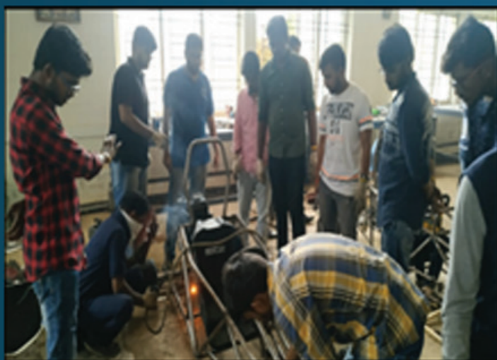
During this internship, staff & students have designed and developed race car.

Various AICTE Sponsored Conferences, FDPs, seminars and workshops are organized very frequently. Recently 8-days National internship was conducted during Sep'2019. Participants of National internship program applying the theoretical knowledge gained during theory sessions to fabricate race car.