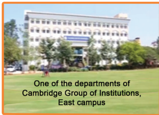
One of the departments of Cambridge Group of Institutions, East campus

Send scanned copy of registration form to organizing Secretary (IFERP) by email to info@icsem.net and also to Convener, CIT-NC, prasadmjs1952@gmail.com