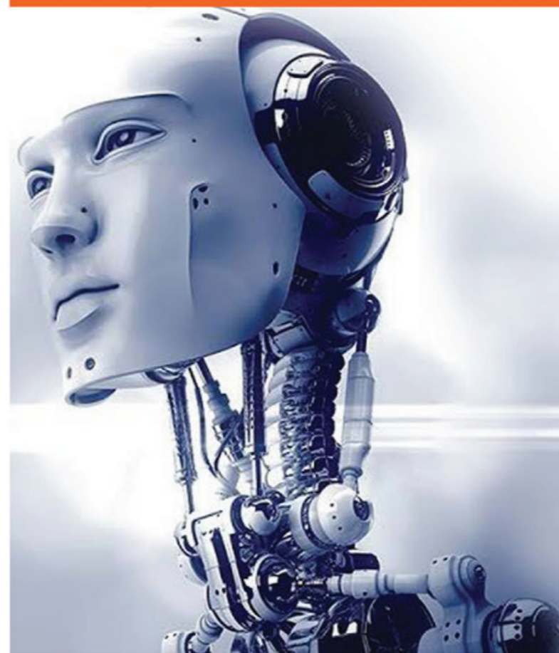
Photo indicating the theme of the conference - Robotics