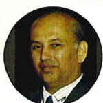
Receipient of 2 nd "Vignatham" Award 2017 Padma Vibhushan, Padma Bhushan Dr. UR Rao, FRS