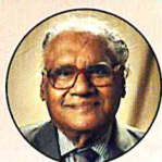
Receipient of 1 st "Vignatham" Award 2016 Bharat Ratna Dr. CNR Rao, FRS