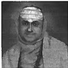
His Holiness Jagadguru "Sri Shivarathri Deshikendra Mahaswamigalavaru" President, JSS Mahavidyapeetha, Mysuru