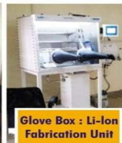
Glove Box : Li-Ion Fabrication Unit