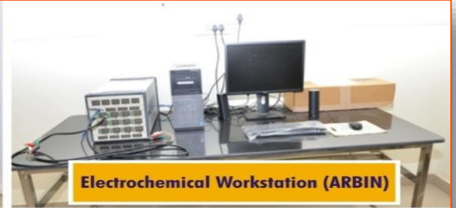
Electrochemical Workstation (ARBIN)