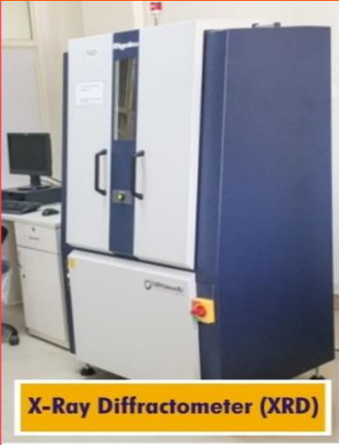
X-Ray Diffractometer (XRD)