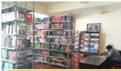
Library and Information Center