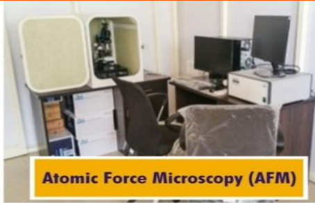
Atomic Force Microscopy (AFM)