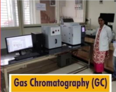
Gas Chromatography (GC)